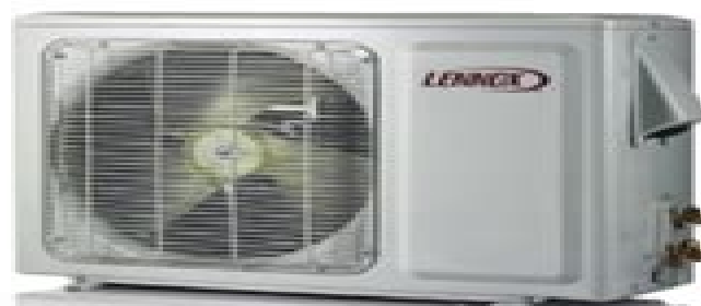
MS8-CO Air Conditioner Outdoor Unit MS8-HO Heat Pump Outdoor Unit