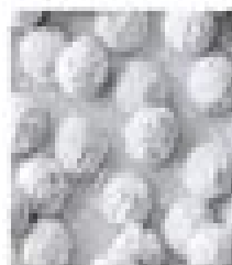
Homemade Wedding Cake Cookies ... Macadamia nuts and pineapple ...