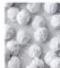
Homemade Wedding Cake Cookies ... Macadamia nuts and pineapple ...