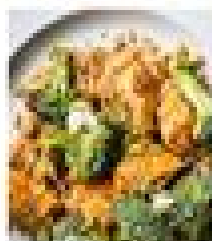
Golden Fried Teriyaki Chicken ... Everyone loves teriyaki chicken ...