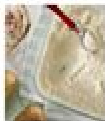
Homemade Vanilla Ice Cream ... We don't want to buy, but we do ...