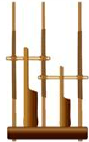
ANGKLUNG JAWA BARAT