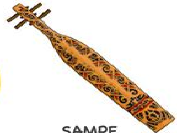
SAMPE KALIMANTAN TIMUR

Sumber: artikel utakatikotak, Materi "Alat Musik Tradisional dan Asalnya"