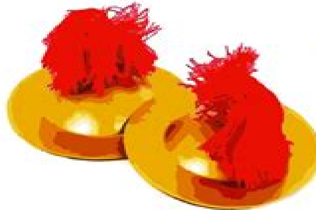
CENG CENG BALI