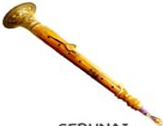
SERUNAI NUSA TENGGARA BARAT