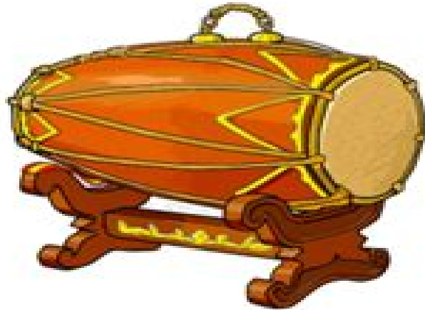
KENDANG JAWA TIMUR