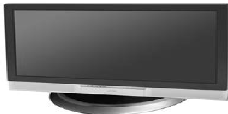
Illustration of PD-42X776 and RM-C14G