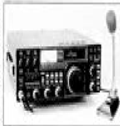
Fig. 1 IC-751 Transceiver and Accessories