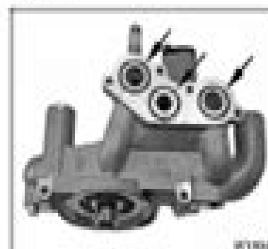
Figure 492 Oil filter base assembly O-rings

⚠ CAUTION: To prevent personal injury or death, contain and dispose of engine fluids in a proper container according to applicable regulations.