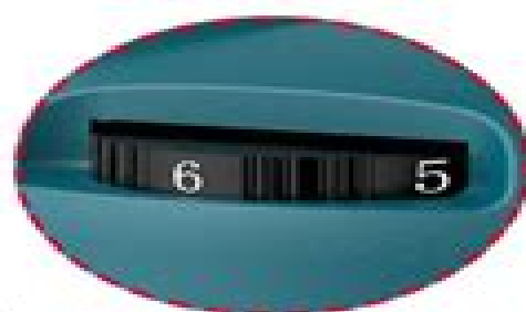
Speed Adjustment Button Кнопка регулювання швидкості