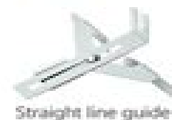
Straight line guide