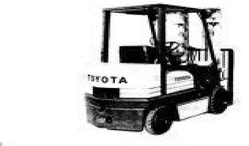
Vehicle Rear View