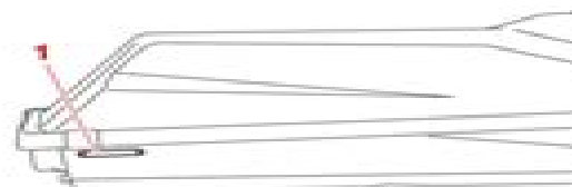
1 Craft Identification Number (CIN) location

The CIN is stamped on a plate attached to the hull on the aft, starboard (right) side.