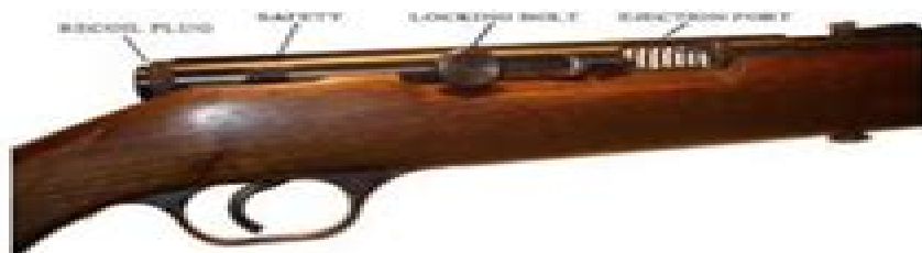
Showing Action Held Open By Locking Bolt

At forward end of tubular magazine under barrel, unlock magazine follower tube and withdraw until loading port in magazine tube is exposed. Insert bullet FORWARD, 15 .22 Long Rifle Cartridges, either regular or high speed with lubricated bullets. (It is important for the successful operation of the automatic loading feature that only .22 Long Rifle Cartridges with lubricated bullets be used). NEVER USE DRY BULLETS. Close magazine by locking magazine follower tube securely in magazine tube.