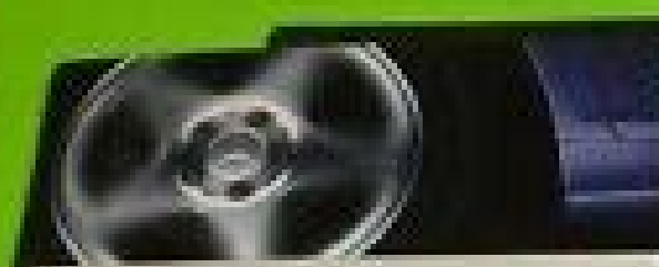
Spare and Wheel Information (TMD Page 10)