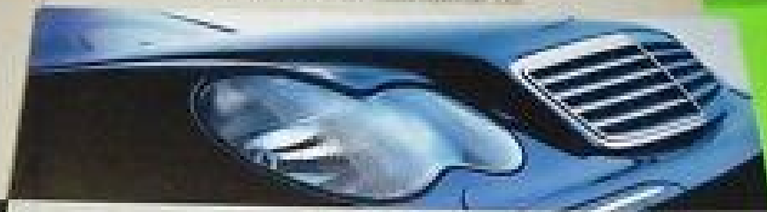
U-Class Sedan Operator's Manual