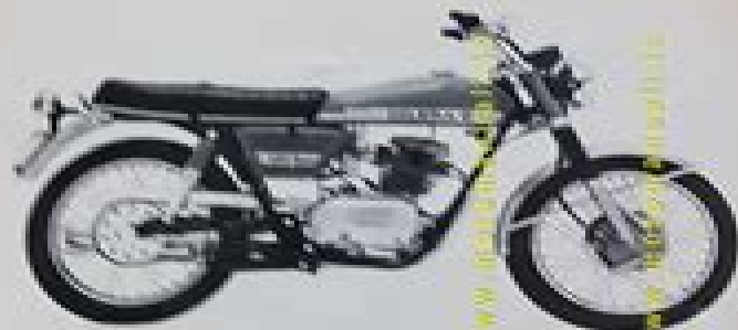
Fig. 1 - Motociclista a 150 cc. Versione a 150 cc. (destro)