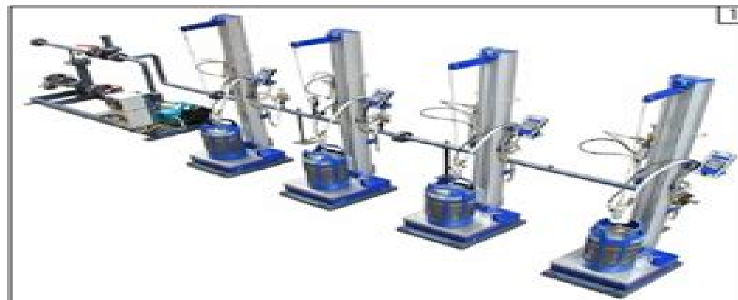
One-man LPG filling unit with four UFM universal filling machines and complete platform with LPG pump unit, ex-proof power panel and piping arrangement (incl. filter, differential pressure valve and LPG liquid level sensor)