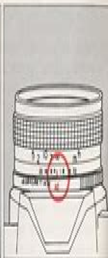
4. Set lens to AE position. (P.15)