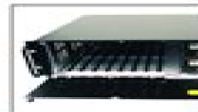
Eight slots for plug-in, hot-swappable port processors

As technology moves faster and faster, the MegaNAC 180 plays a strategic role in the Hypercom framework. Network owners know they can freely evolve from one technology to another with the assurance that yesterday's systems will seamlessly integrate into tomorrow's newest offerings.