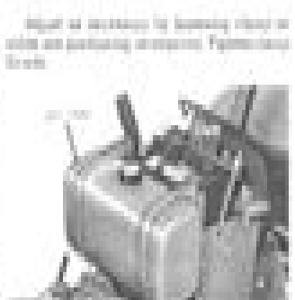
Fig. 10-8 Tractor engine assembly

Remove the governor and fuel system. Remove the governor and fuel system. Remove the governor and fuel system.