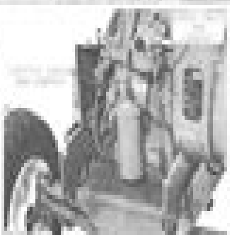
Fig. 10-6 Tractor engine assembly

Remove the carburetor and fuel system. Remove the carburetor and fuel system. Remove the carburetor and fuel system.