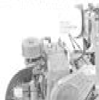
Fig. 10-7 Tractor engine assembly

Remove the governor and fuel system. Remove the governor and fuel system. Remove the governor and fuel system.