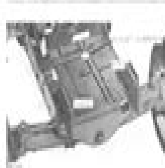
Fig. 10-5 Tractor engine assembly

Remove the governor and fuel system. Remove the governor and fuel system. Remove the governor and fuel system.