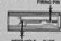
STOP HOLE SLIDE

SLICK, Inc. 8000 Highlands Parkway Brea, CA 92603 U.S.A.