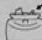
RIGHT SIDE FRAME VIEW