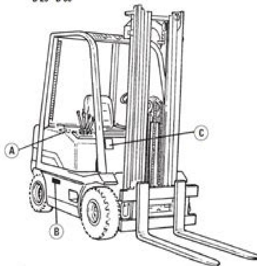
Fig. 1 - Ubicazione dati di identificazione Fig. 1 - Position des données d'identification Fig. 1 - Location of identification data Abb. 1 - Kenndaten stellen Fig. 1 - Ubicación datos de identificación