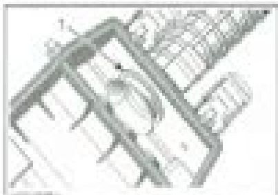
1. Realign intake elbow recess with notch on air filter housing.

If the intake elbow is removed, reseat it with LOCTITE 590 (only 202-600 041) and align its recess with the notch on air filter housing.