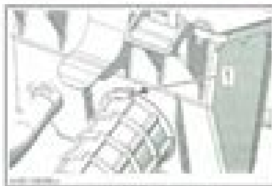
1. Intake elbow reseat into air filter housing notch.