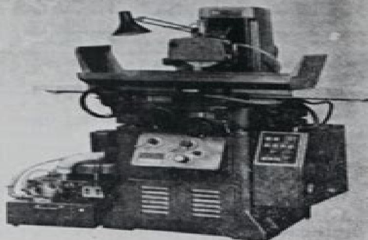
Model: FSG-2A20 FSG-2A200 FSG-3A20