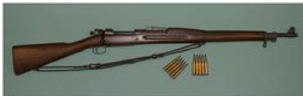
Springfield M1903 Rifle