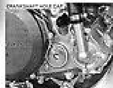
CRANKSHAFT HOLD CAP