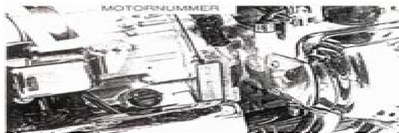
MOTORNUMMER Die Motornummer ist auf der Rückseite des rechten Kurbelgehäuses eingepreßt.