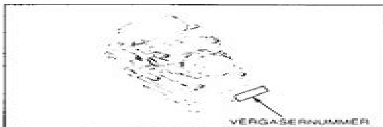
VERGASERNUMMER Die Vergasernummer ist auf der Seite des Vergasergehäuses eingeschlagen.