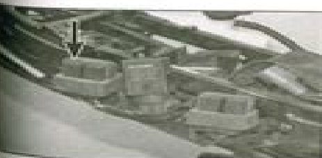
8.3a Headlight relay (arrowed) - CB models

Refer to electrical system fault finding in Section 2 and to the wiring diagram for your model at the end of this Chapter.