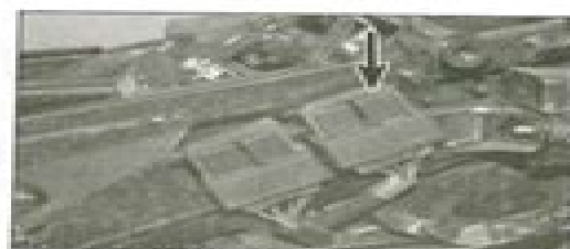
8.3b Headlight relay (arrowed) - CBF models

1 If a light fails, first check the bulb (see relevant Section), and the bulb terminals in the holder. If none of the lights work, check the battery (see Section 3). Low battery voltage indicates either a faulty battery or a defective charging system. Refer to Section 3 for battery checks and Section 28 for charging system tests. Also check the fuses (Section 5) - if there is more than one problem at the same time, it is likely to be a fault relating to a multi-function component, such as one of the fuses governing more than one circuit, or the ignition switch. When checking for a blown filament in a bulb, it is advisable to back up a visual check with a continuity test of the filament as it is not always apparent that a bulb has blown.