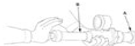
Fig. 3: Applying Pressure On Pressure Tester Attached To Radiator Cap Seal