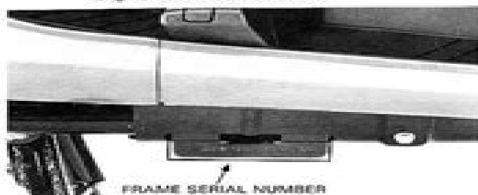
FRAME SERIAL NUMBER

BEGINNING Frame No. JH2MF020 GK000001 No. JH2MF021 GK000001 (California model) Engine No. MF02E-5000001