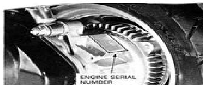
ENGINE SERIAL NUMBER

The VIN (Vehicle Identification Number) is attached to the left side of the leg shield.