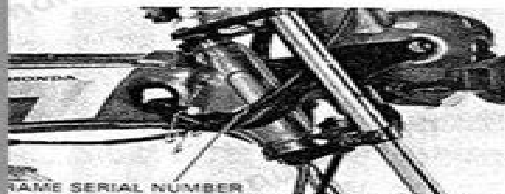
FRAME SERIAL NUMBER

The frame serial number is stamped on the right side of the engine head.