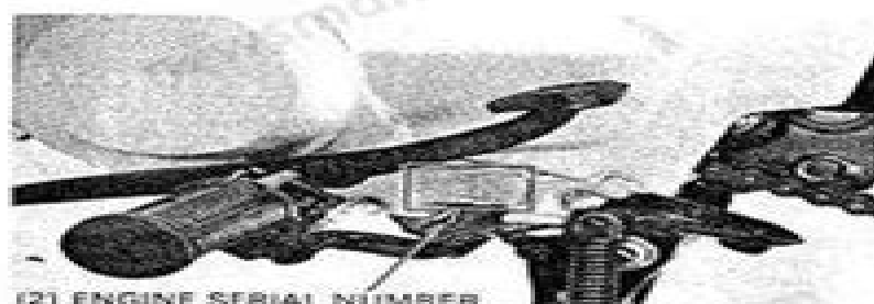
(2) ENGINE SERIAL NUMBER

The frame serial number is stamped on the right side of the engine head.