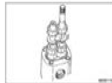
Premium pump configuration