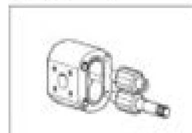
Standard pump configuration

Slide the front bushes (C20 and C21) into their original frame, remembering that the C-nut must be on the side of the body with the pump control flange. They must match the rear end bushes.