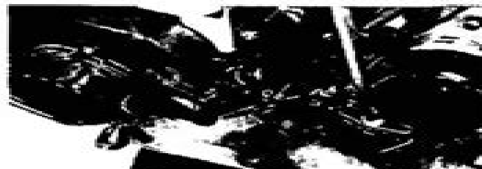
Fig. 1-4 ② Oil cap