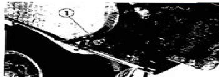
Fig. 1-3 ① Drain bolt