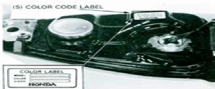
(5) COLOR CODE LABEL

The carburetor identification number is on the left side of the carburetor body.