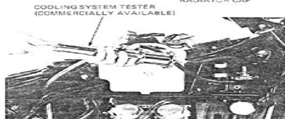
COOLING SYSTEM TESTER (COMMERCIALLY AVAILABLE)

Repair or replace components if the system will not hold the specified pressure for at least six seconds.