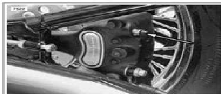
Figure 1-15. Rear Brake Bleeder Valve