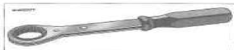
Figure 3-16. Crankshaft Rotating Wrench