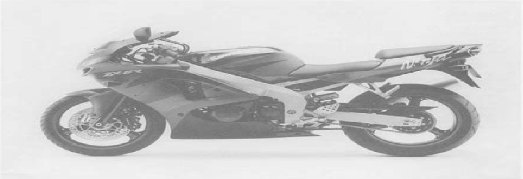
ZX600-H1 Right Side View: