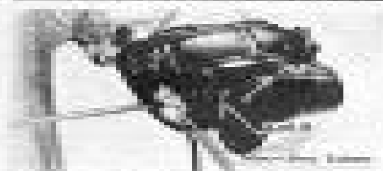
Working on the carburetor

1. Remove the carburetor from the engine and clean it.