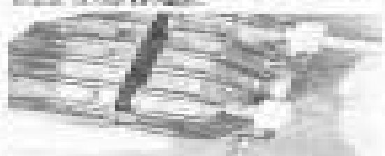
Remove the fuel filter

5. Remove the fuel filter from the fuel line. The fuel filter is the small metal piece that filters the fuel. If it is dirty, clean it.