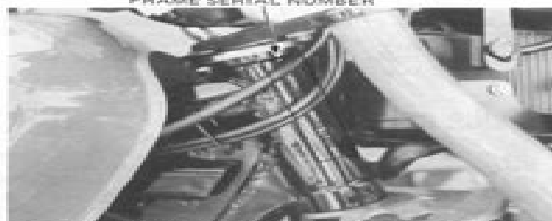
FRAME SERIAL NUMBER

The frame serial number is stamped on the steering head right side.