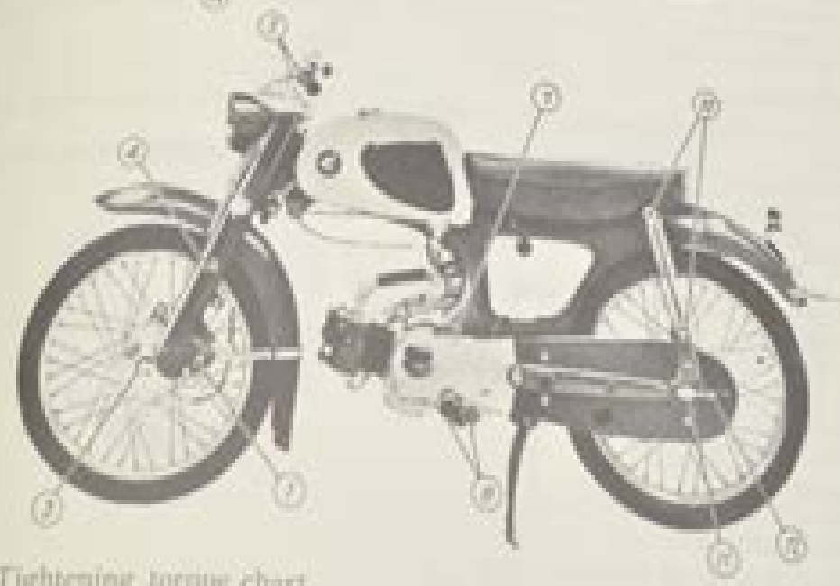
Tightening torque chart.