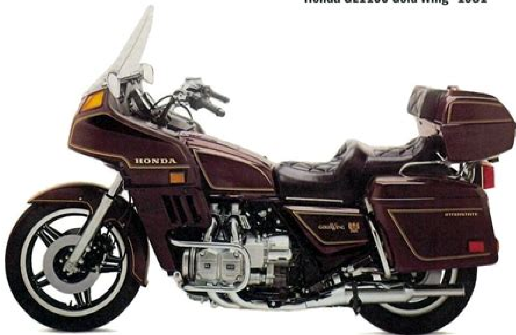
Honda GL1100 Gold Wing 1981