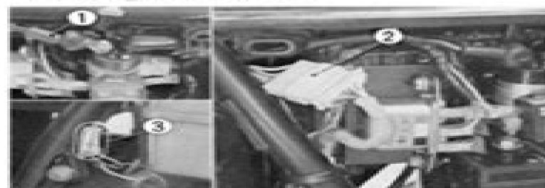
Abb. 2-5 ① Anlasserkabel ② Lichtmaschinensteckverbindung ③ Zuleitung für Bremslichtschalter