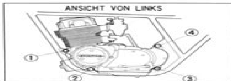
① 19 mm Sechskantschraube ② Motoraufhängungsschraube A ③ Blindloch untere Motoraufhängungsschraube

8. Den Kupplungszug am Kupplungshebel abmontieren. (Abb. 2-3)