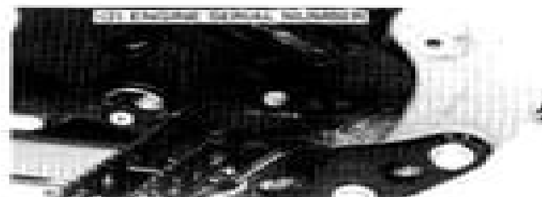
The engine serial number is stamped on the lower left side of the crankcase.