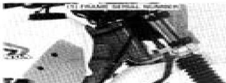
The frame serial number is stamped on the right side of the steering head.