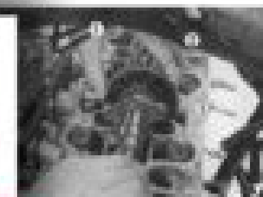
Fig. 10 (A) Cam chain (B) Timing marks