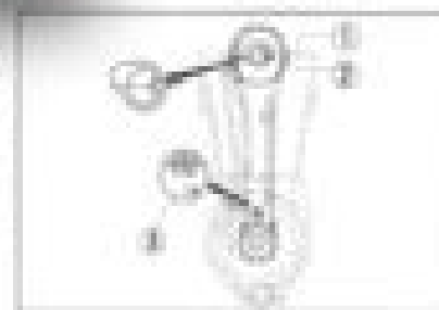
Fig. 11 (A) Crankshaft (B) Camshaft (C) Timing marks