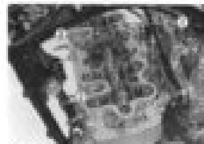
Fig. 12 (A) Direct pins (B) Timing rollers