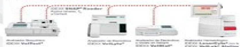
Parte de IDEXX VetLab® Suite

El Analizador IDEXX VetAutoread™ constituye una parte integral de IDEXX VetLab® Suite, una gama de analizadores específicos para veterinarios que ofrecen capacidades de diagnóstico sin precedentes para clínicas y la posibilidad de obtener información consolidada. IDEXX Vet-