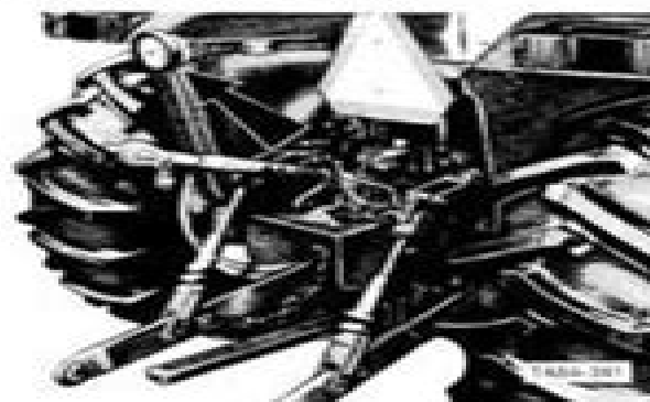
Rear Work Light

One rear work light is provided which also houses the red rear light.